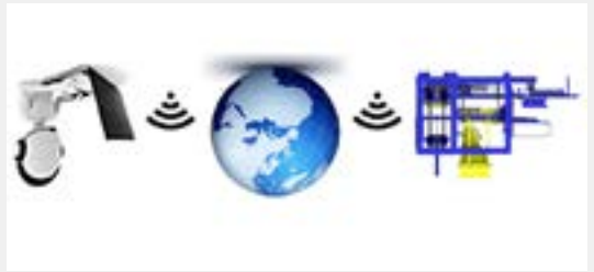
Online technical assistance