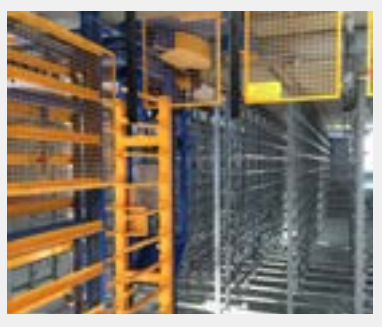
Rotation finger car