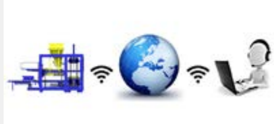
Online technical assistance