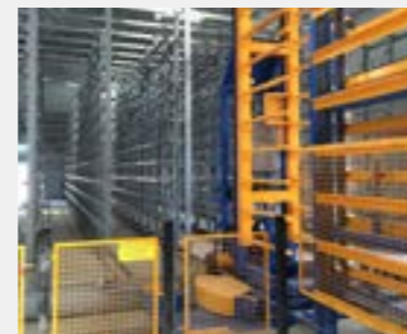
Rotation finger car